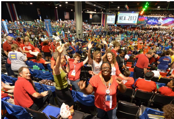
Missouri's delegation also consists of MNEA-Retired, Aspiring Educators, local association and cluster delegates.