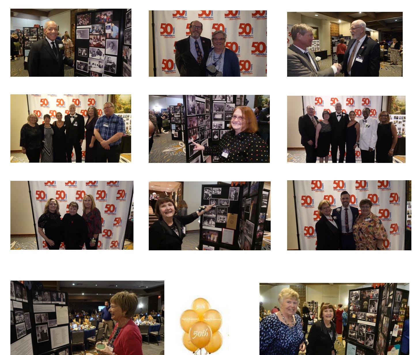
Pictures, memorabilia, and catching up with old friends was the order of the day.