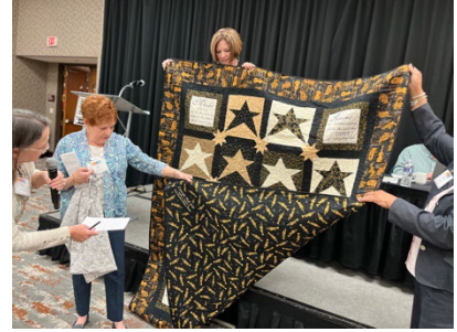
Handmade music quilt

And there was a great crowd looking at all the bag goodies and buying their tickets to hopefully win. This year, we were able to use QR codes for folks to purchase tickets. MNEA-Retired travels into new technology.