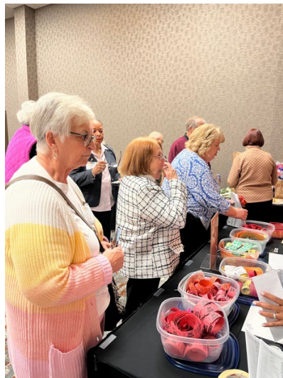
Shopping for goodies!