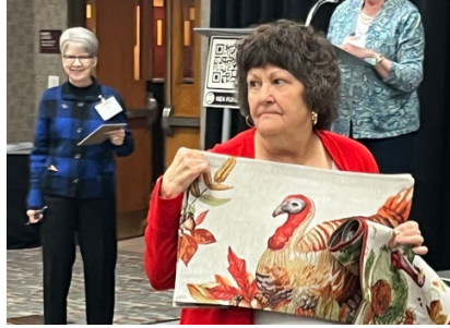
Thanksgiving table linens