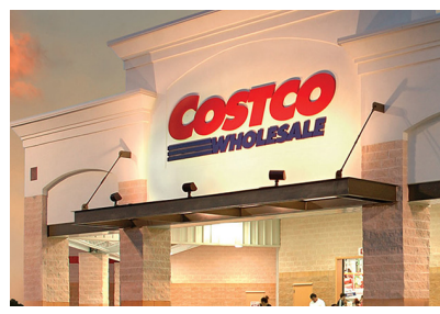
NEA Savings at COSTCO