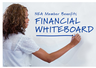
Check Out the NEA Member